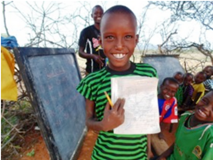
A student in LENTASIM PRESCHOOL showing off his work.

Early childhood education lays the foundation for health, behavior, and learning for years to come. Far too many children start school already behind their peers making it so much harder for them to catch up and keep up.