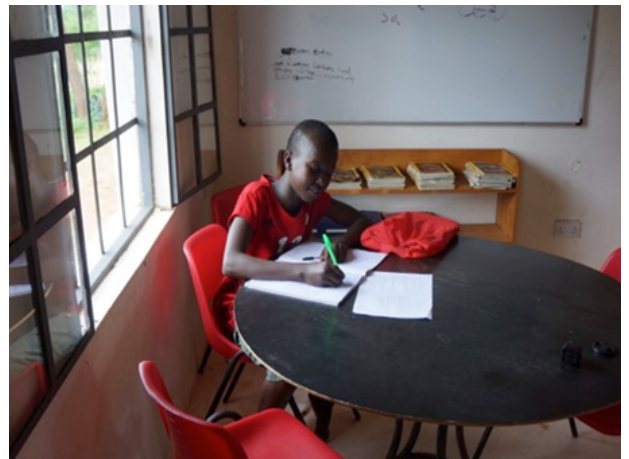
A high school student during the school break studying at the SENEAF Learning Center in Sereolipi

We are incredibly grateful to our high school and college student sponsors, without whose generosity most of these students would not be able to get access to higher education.